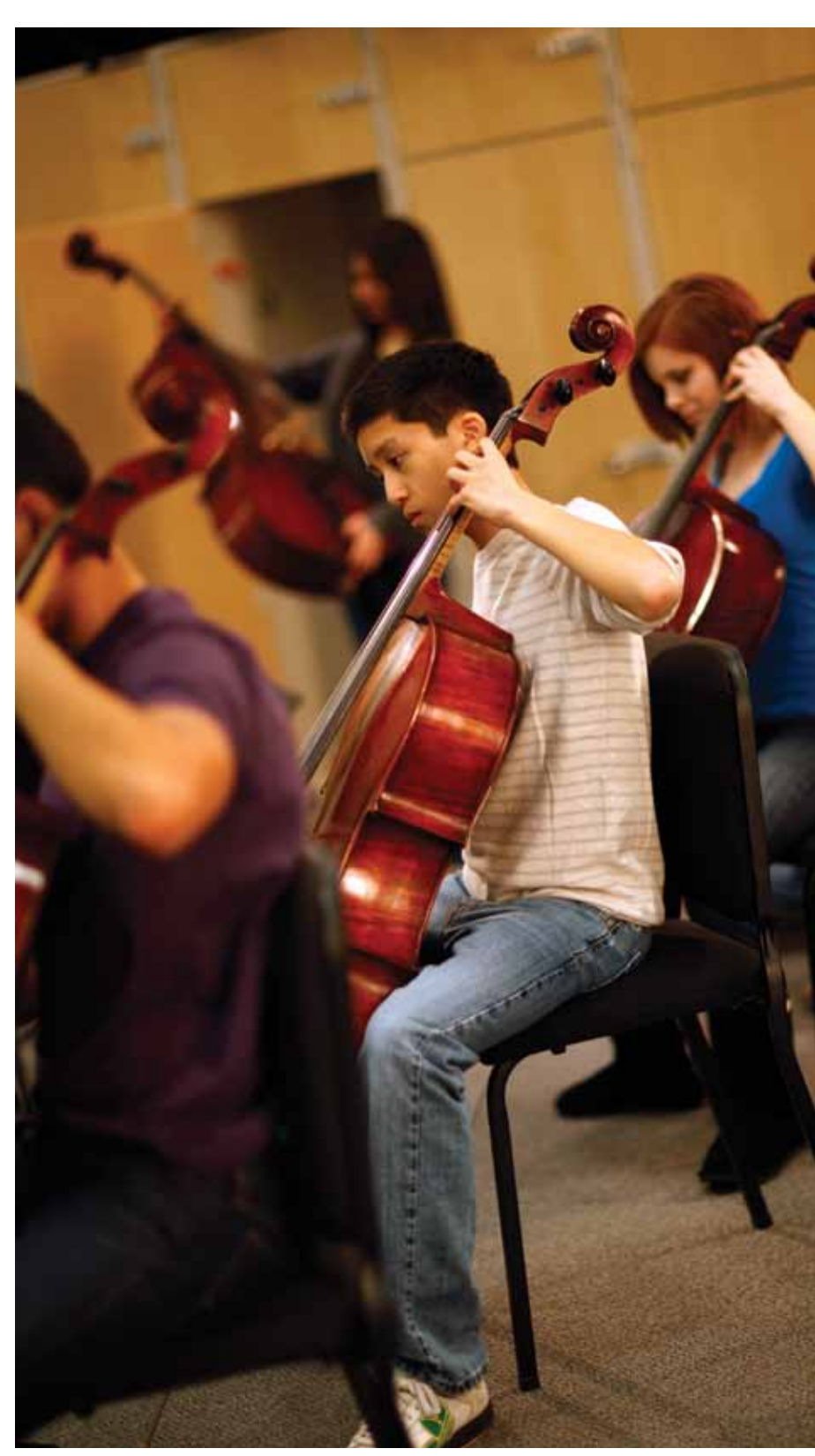
INSTRUMENT STORAGE CABINETS AND CELLO CHAIRS