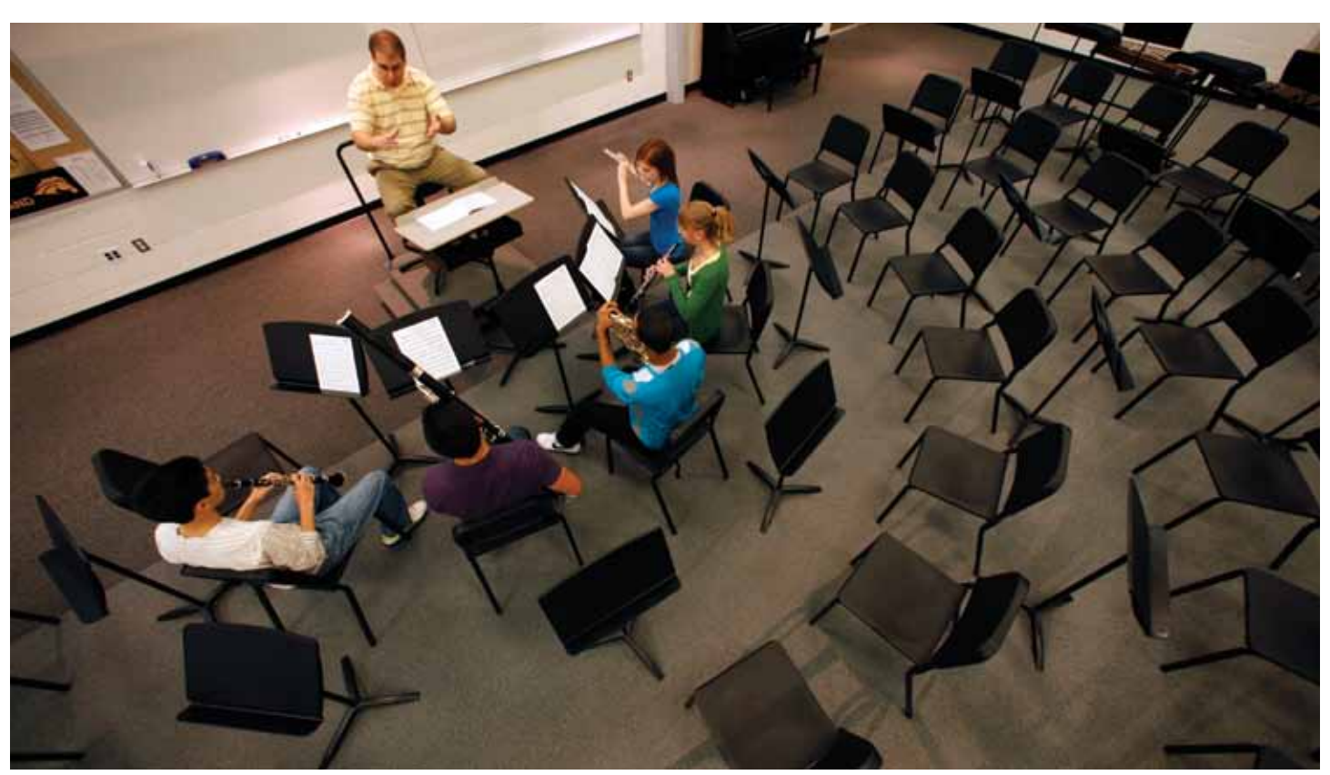
STUDENT MUSIC POSTURE CHAIRS, CLASSIC 50® MUSIC STANDS AND CONDUCTOR'S PODIUM