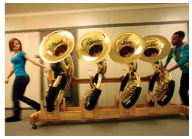
SOUSAPHONE MOBILE STORAGE RACKS

The timpani stay secure on the cart during transport and performance, instead of constantly being picked up and removed, and the cart pulls easily behind a golf cart. "When preparing for a festival, we just roll the Timpani Cart right up into the truck, strap it down and away we go," he notes.