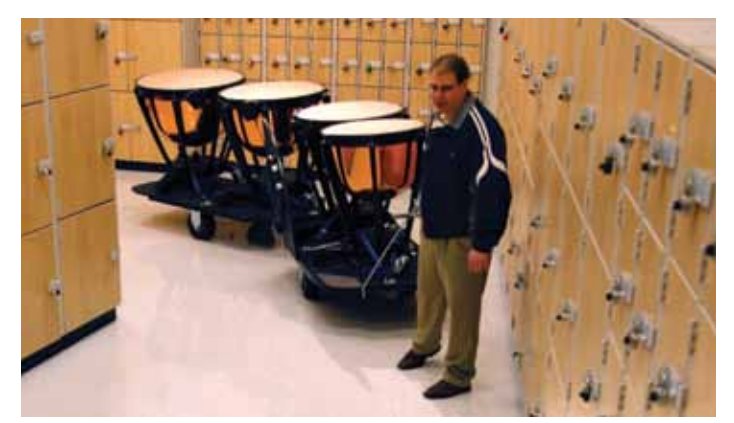
INSTRUMENT STORAGE CABINETS AND ONBOARD® TIMPANI CART

Carpeted Versalite risers were ordered for the choir room; non-carpeted Versalite risers were selected for the auditorium and black box theater. In the black box, the risers serve as audience seating and also make various stage arrangements. If needed, Devany says these platforms can be used for staging elsewhere in the building. The auditorium's Versalite risers are used for band, orchestra, jazz and steel band.