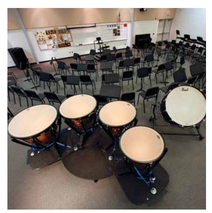
STUDENT MUSIC POSTURE CHAIRS, CLASSIC 50® MUSIC STANDS, CONDUCTOR'S PODIUM, WHITEBOARD AND ONBOARD® TIMPANI CART